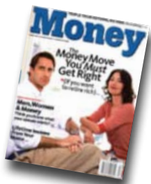
Singles out HardiePlank, "it delivers on durability" - Money magazine