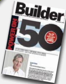
Recognizes James Hardie CEO, Louis Gries, in 50 Most Influential People in Building - Builder magazine