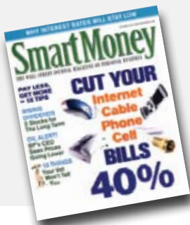
Lists James Hardie in Smart Fiscal Sense feature - Smart Money magazine