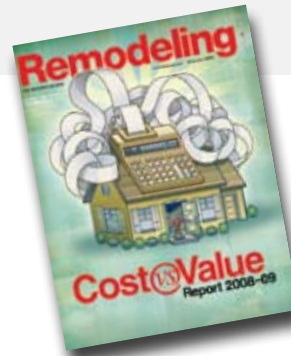
Names fiber-cement siding Your #1 Investment - Remodeling magazine